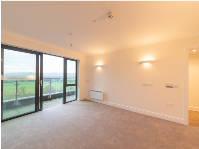
OPEN PLAN LIVING ROOM