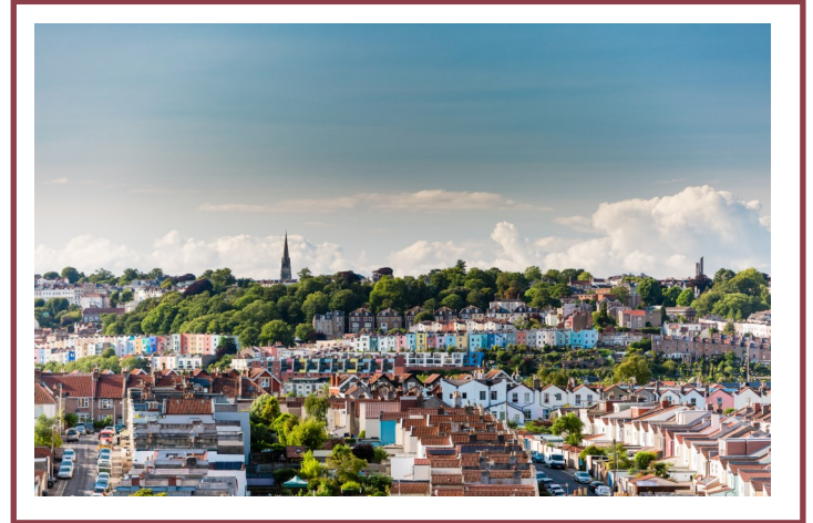
VIEW FROM ROOFTOP GARDEN