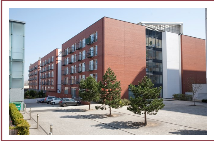
MONICA WILLS HOUSE