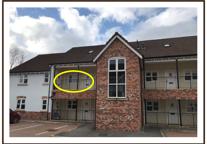
POSITION OF APARTMENT