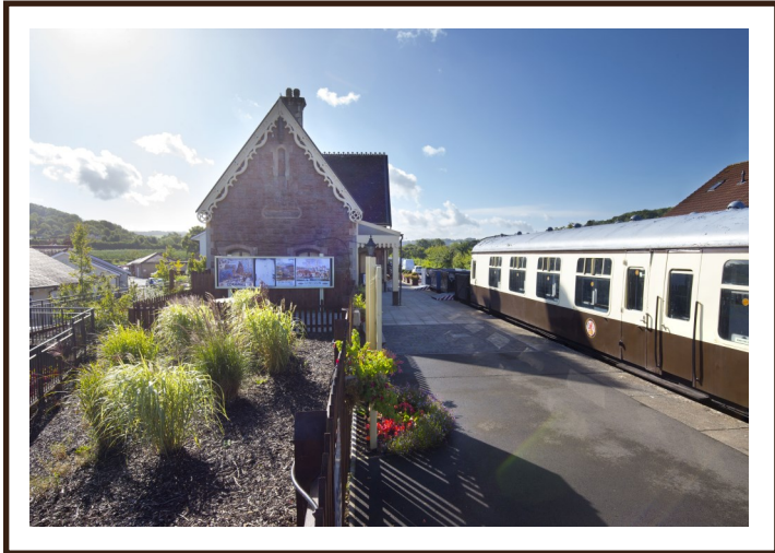
RAILWAY CAFÉ & MUSEUM