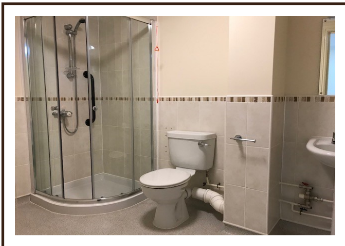
UPSTAIRS EN SUITE SHOWER ROOM