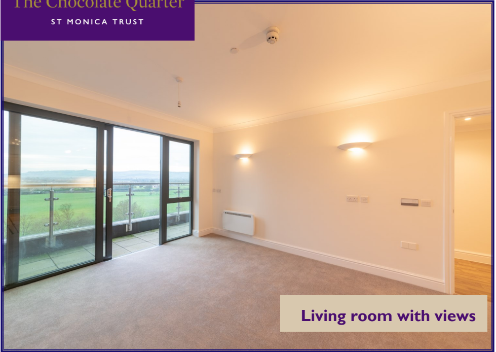
Living room with views