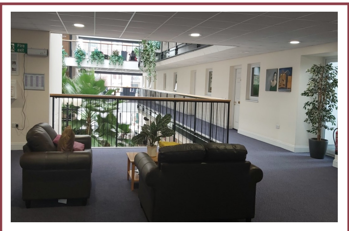
ATRIUM FLOOR LANDING