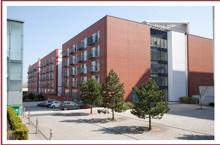
MONICA WILLS HOUSE