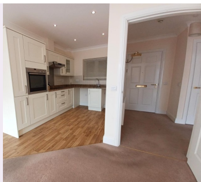
Kitchen and hallway