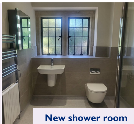
New shower room