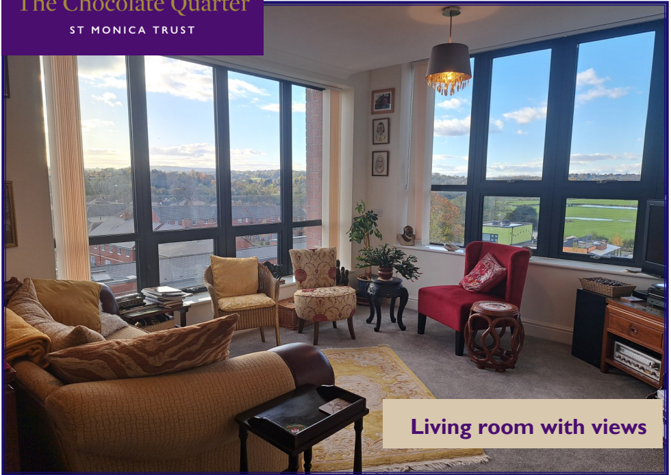
Living room with views