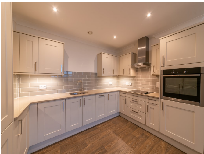
FULLY FITTED KITCHEN