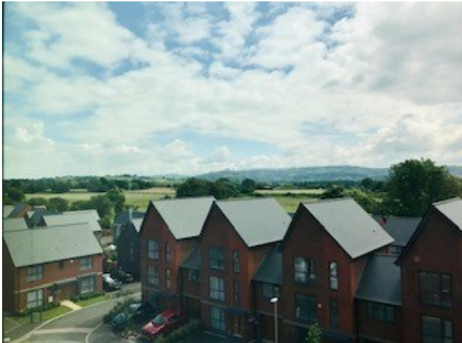
VIEW FROM MASTER BEDROOM AND LOUNGE