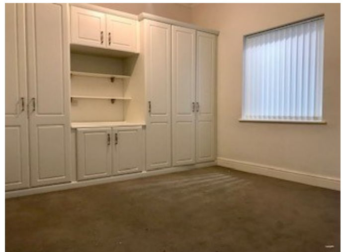
BEDROOM TWO WITH FITTED WARDROBES