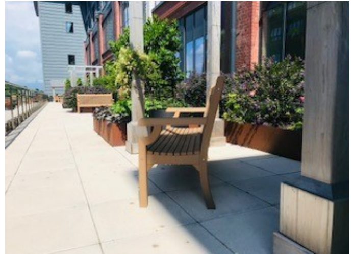
COMMUNAL SECOND FLOOR TERRACE