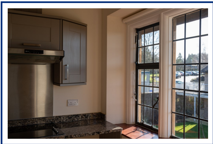
BRIGHT AND MODERN KITCHEN