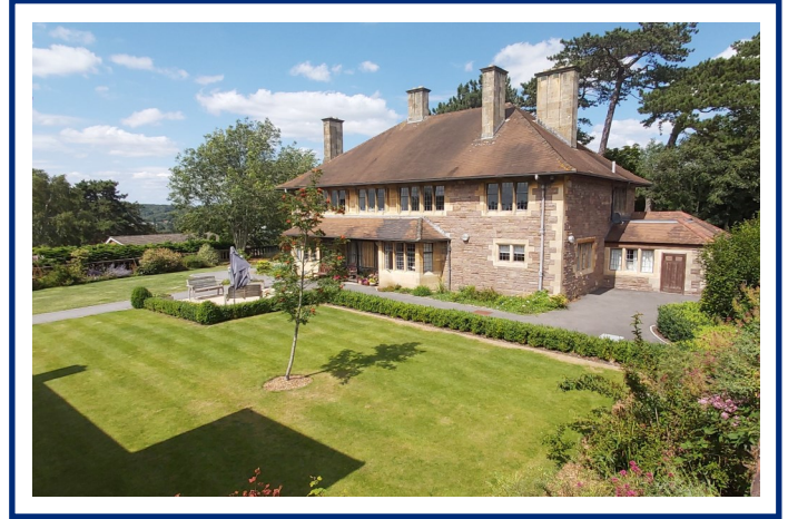
ST AUGUSTINES GARDEN