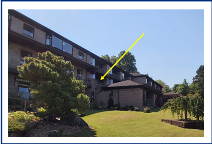
POSITION OF APARTMENT