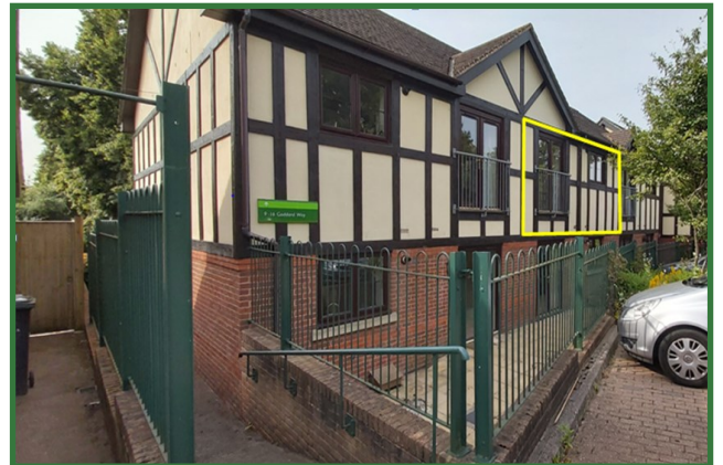
POSITION OF APARTMENT

Community Fee £7,266 single pa / £9,803 couple pa | Council Tax Band B £1,682.84 pa