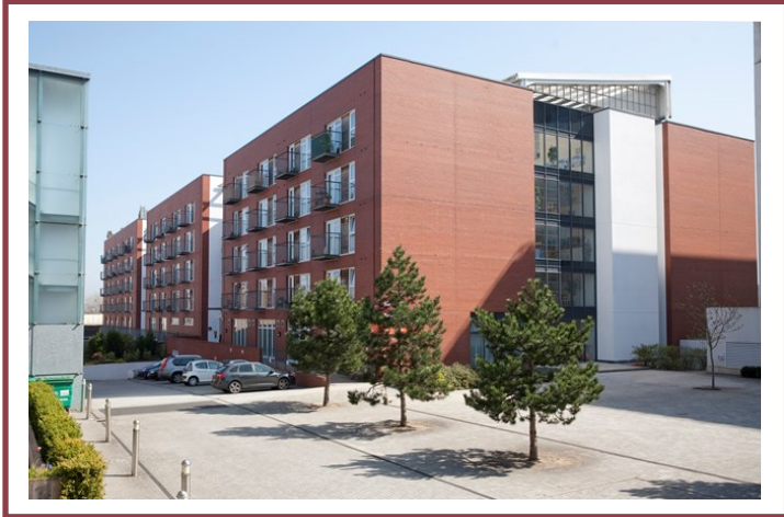
MONICA WILLS HOUSE