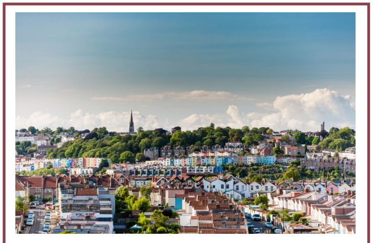
WESTERLY VIEW FROM ROOFTOP GARDEN

Community Fee £4,732 single pa / £5,797 couple pa | Council Tax Band A £1,486.91 pa